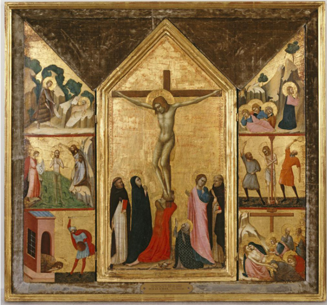
Fig. 3 Attributed to Lippo di Benivieni

The Crucifixion with Scenes from the Passion and the Life of St John the Baptist , c. 1315–20 Tempera on wood panel, dimensions by panel: 63.5 x 17.5; 63.5 x 34.3; 61 x 16.5 cm (25 x 6 7/8; 25 x 13 1/2; 24 x 6 1/2 in.)