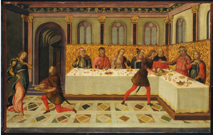
Fig. 1 Master of the Apollo and Daphne Legend The Martyrdom of Saint John the Baptist , c. 1500 Paint on wood, 59.7 x 94.3 cm (23 1/2 x 37 1/8 in.) Howard University Gallery of Art, Washington, DC, Samuel H. Kress Collection