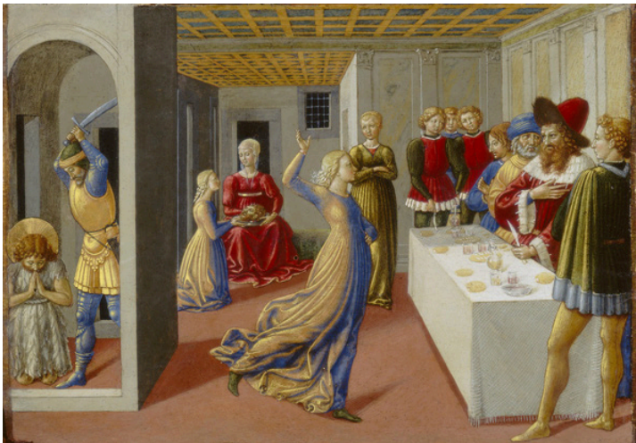
Fig. 2 Benozzo Gozzoli The Feast of Herod and the Beheading of Saint John the Baptist , 1461–2 Tempera (?) on panel, 23.8 x 34.5 cm (9 3/8 x 13 9/16 in.) National Gallery of Art, Washington, DC, Samuel H. Kress Collection