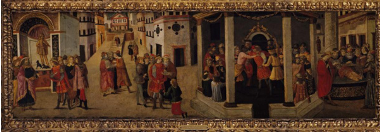
Fig. 8 Master of the Apollini Sacrum The Death of Julius Caesar , late 15th century Tempera on wood, 47 x 150.43 cm (18 1/2 x 59 1/5 in.) Spencer Museum of Art, University of Kansas, Samuel H. Kress Collection