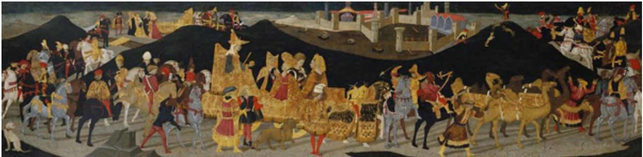
Fig. 7 Apollonio di Giovanni and workshop