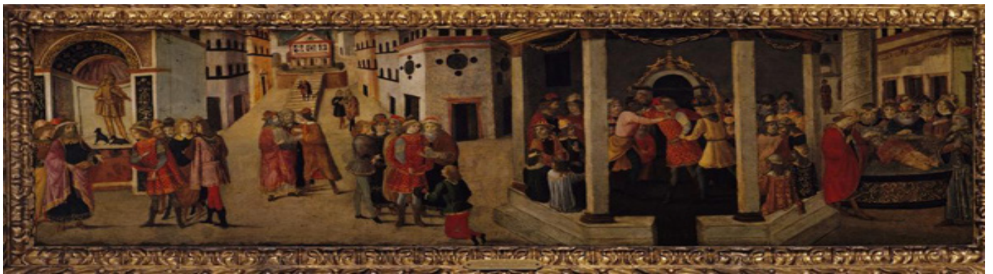
Fig. 4 Master of the Apollini Sacrum

Memphis Brooks Museum of Art, Memphis, Gift of the Samuel H. Kress Collection