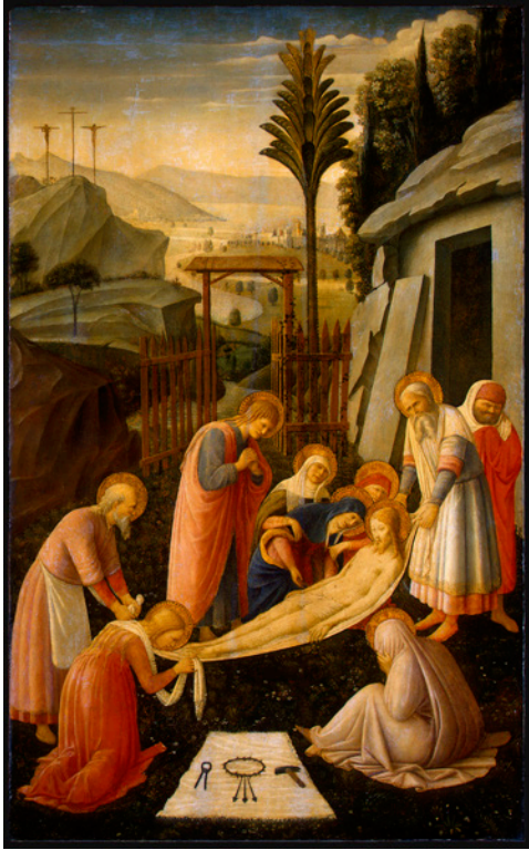
Fig. 6 Attributed to Fra Angelico